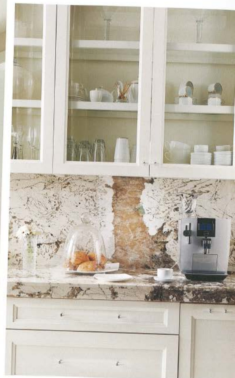
Above: In the kitchen, striking Brazilian granite from Arizona Tile sheathes the backsplash, countertops and island. Cabinetry from R & G Custom Crafting boasts a painted ivory finish and features Lucite pulls from Central Arizona Supply. Left: Upholstered stools by Swaim provide seating at a waterfall-style island beneath quiet pendants from Hinkley's Lighting Factory in the kitchen. The porcelain tile here and throughout the home is from Facings of America.